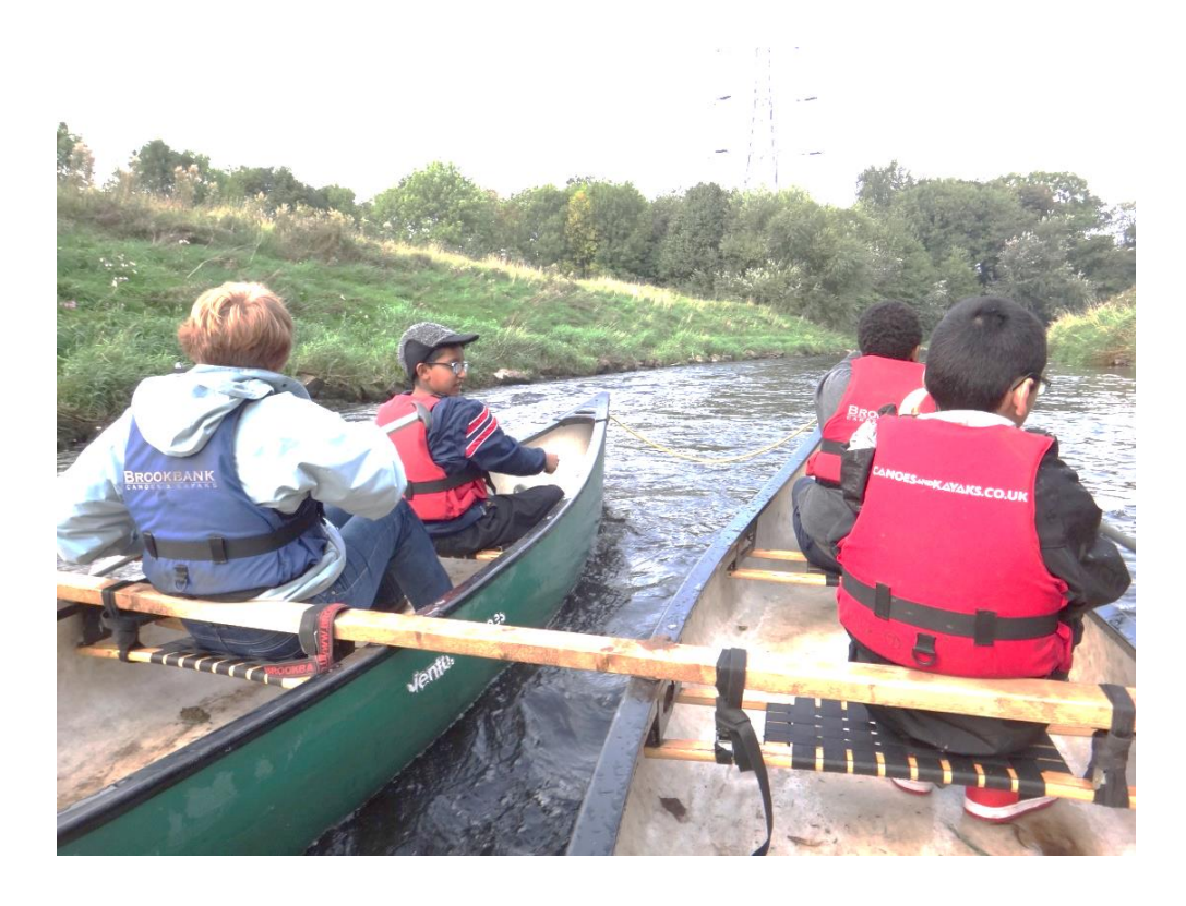
Pupils can get out of boats to study the corner to study deposition and erosion and flow speeds.