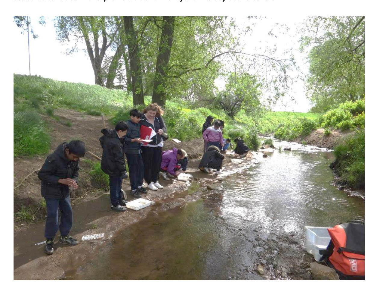
River dipping equipment and identifications sheets used to determine water quality (moderately clean)